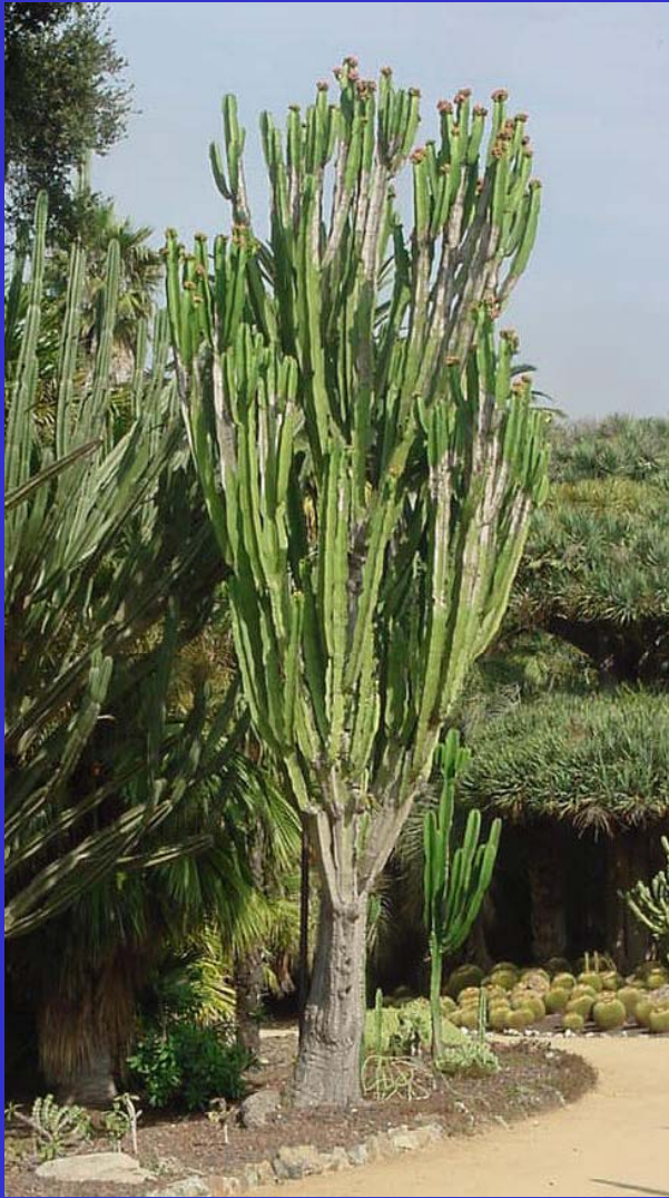
Succulent Euphorbia Africa, Europe Middle East, Sub Continent

Cactus only grow in the Western Hemisphere